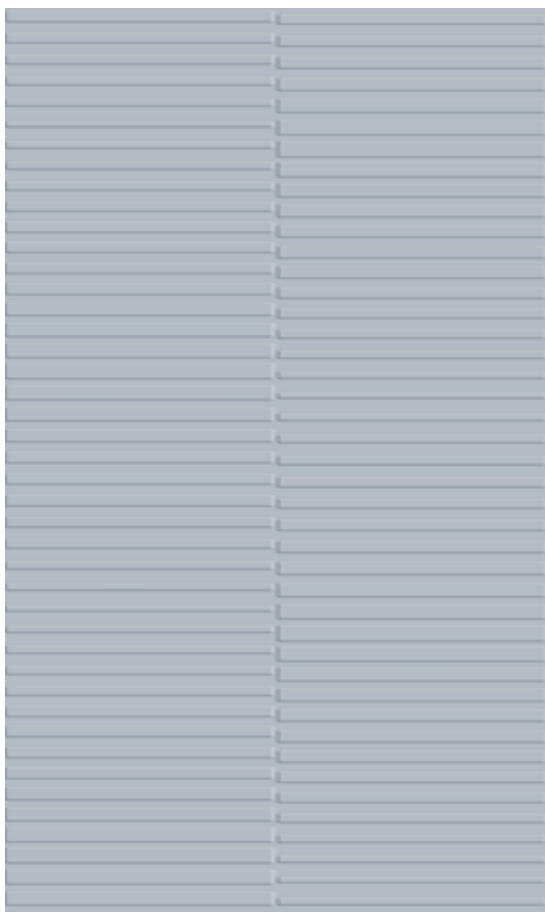
Figure 3 Picture of an earthenware tile

The waste derived from the packaging of the pieces is managed separately according to the geographical location of the installation site. Otherwise, 3% of product losses have been considered at the installation stage.