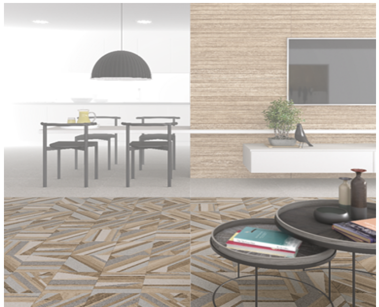
Figure 1 Installed product.

The spray dryer includes a simultaneous heat and electricity cogeneration system by means of gas turbines, using natural gas as fuel. The combustion of natural gas provides hot gases directly to the drying stage. The electrical energy generated is partly used in the industrial plant, thus reducing the electrical requirements of the grid, and the rest is fed into the grid for sale and subsequent distribution. In this study, the generation of electricity sold to the grid has been considered as a moved load, specifically, to thermoelectric production from fuel oil/gas, according to the rate reported in Eurostat 2018.