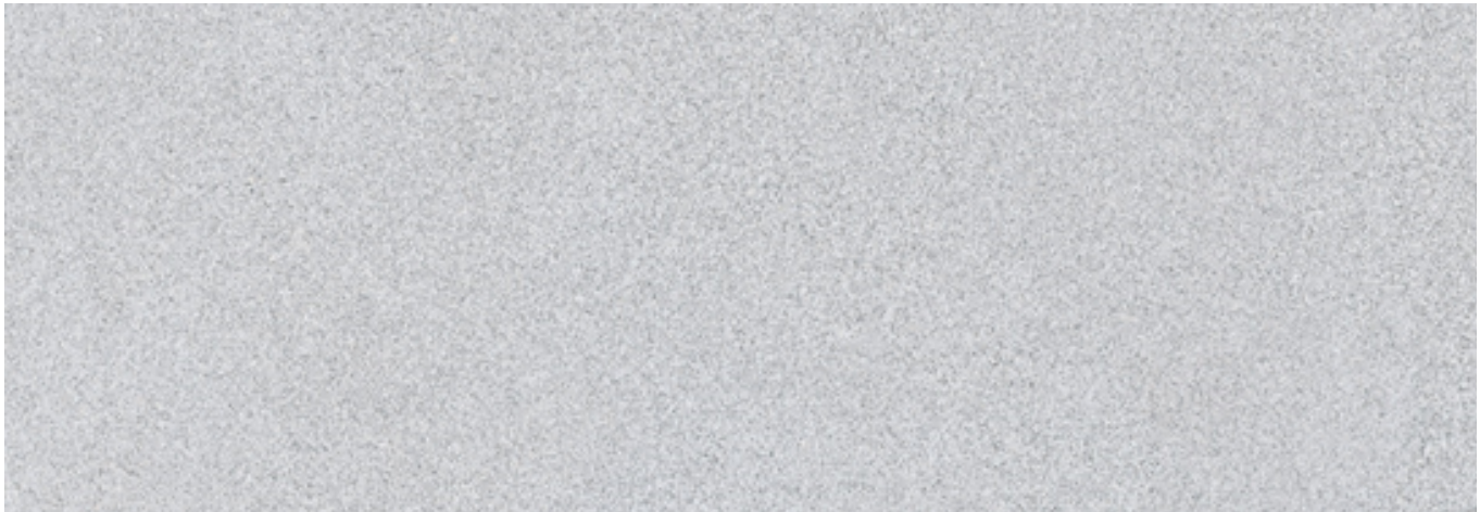
Figure 4 Picture of an earthenware tile

The environmental burdens and benefits of obtaining secondary material from waste generated at the manufacturing stage (waste such as cardboard, plastic and wood), at the installation stage (product losses, tile packaging waste: cardboard, plastic and wood) and at the end of life of the product have been considered.